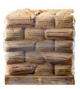
1920 lb - 2000 lb Pallets